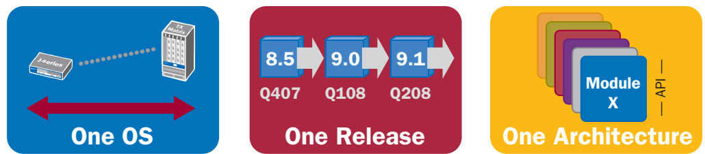
Figure 2: The JUNOS software utilizes a single source code, follows a predictable release train, and employs a modular architecture to ensure the consistent implementation of control-plane features across product lines.

In addition, each Juniper switch platform runs the same JUNOS software, which ensures a consistent implementation and operation of each control plane feature across the entire Juniper product line.