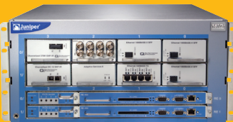
Juniper Networks M101