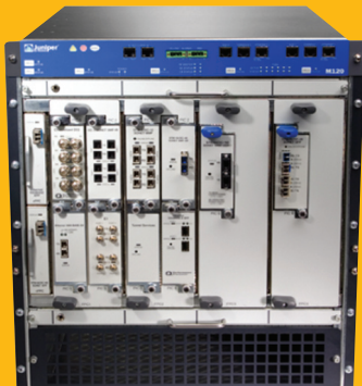
Juniper Networks M120